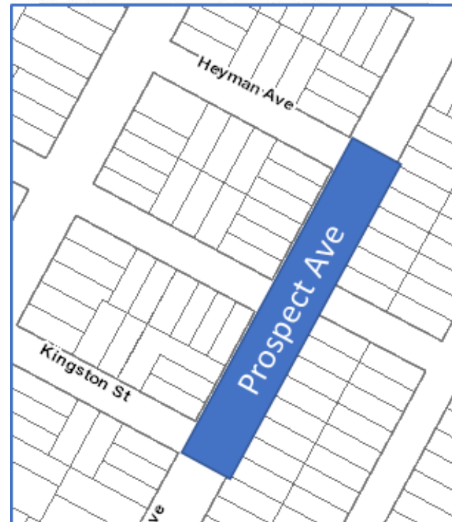
Prospect Avenue from Kingston Street to Heyman Avenue

Contact: SFPUC Communications (888) 801-2661 or skech@sfgwater.org After hours: 3-1-1