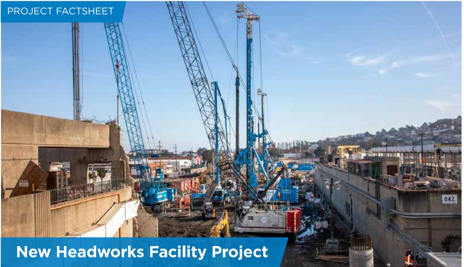
Pictured above: New Headworks Facility Project Construction