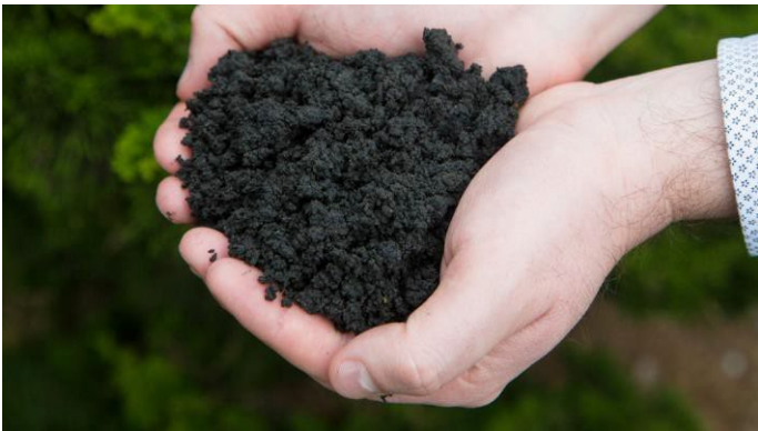
SFPUC process engineer, holding biosolids produced at the Oceanside Treatment Plant