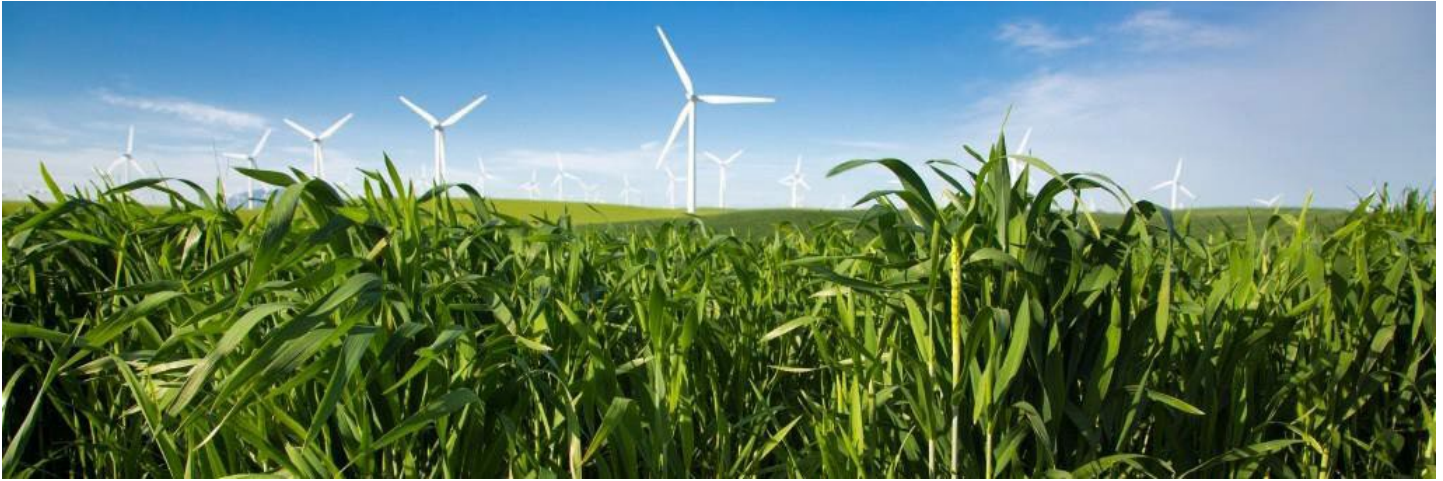
Bay Area ranch where SFPUC biosolids are used as a soil amendment