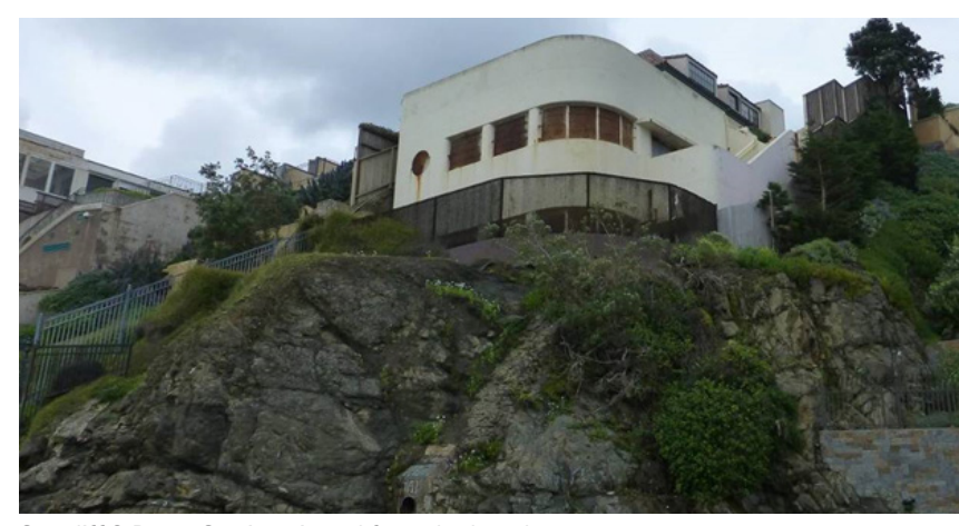
Seacliff 2 Pump Station viewed from the beach.

Our combined sewer system is mostly gravity operated, but in some parts of the City, pump stations are necessary to pump combined wastewater flows to treatment facilities. To convey the flows from the pump stations, force mains are the pressurized pipes that help move flows from the pump station and through the system. Many of our aging pump stations and force mains are being upgraded as part of the Sewer System Improvement Program.