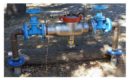
Example of a Backflow Prevention Assembly

You are responsible for arranging for annual testing of your backflow prevention assemblies by a tester approved to work in San Francisco. The tester must have a valid Permit to Operate issued by the San Francisco Department of Public Health. A list of companies employing Authorized Backflow Prevention Assembly Testers is available at <u>www.sfdph.org/backflow</u>.