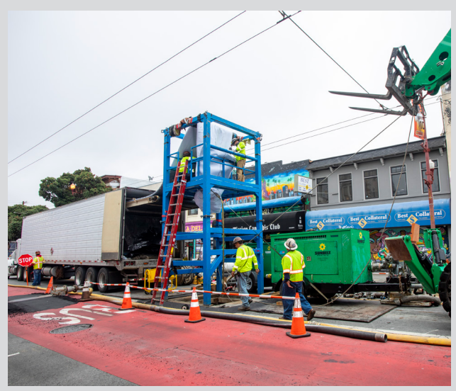
Mission Street, 16th to Cesar Chavez, Brick Sewer Rehabilitation Project: The project uses a trenchless method called cured-in-place pipe (CIPP) technology to rehabilitate the brick sewer tunnel. CIPP lining is pulled into place with water and cured with hot water.