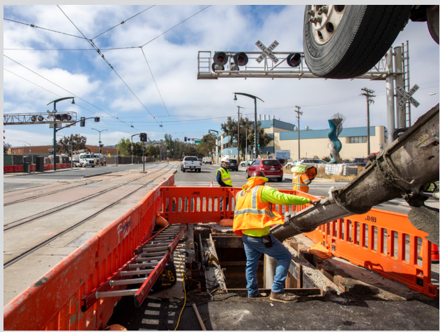
Cargo Way Box Sewer Odor Reduction Project: Concrete pour on southbound lane of Third Street at Cargo Way for the base of the manhole. Concrete elephant trunk method of pouring concrete.