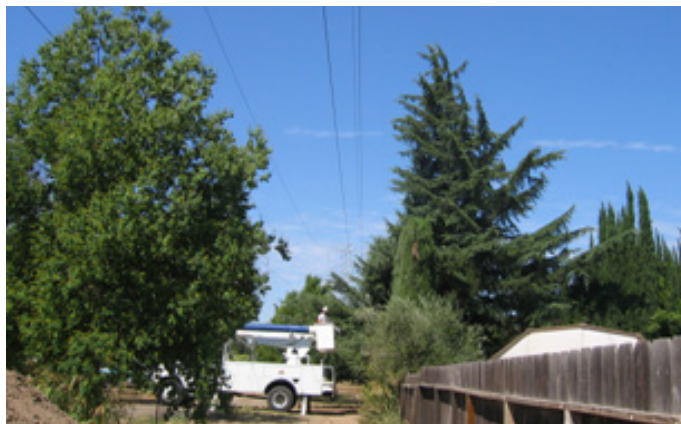
HHWP crews trimming trees on the ROW.

Mature trees whose trunks and major limbs are located more than six inches, but less than 18 inches, from primary distribution conductors are exempt from the 19-inch minimum clearance requirement under this rule. The trunks and limbs to which this exemption applies shall only be those of sufficient strength and rigidity to prevent the trunk or limb from encroaching upon the six-inch minimum clearance under reasonable foreseeable local wind and weather conditions. The utility shall bear the risk of determining whether this exemption applies, and the Commission shall have the final authority to determine whether the exemption applies in any specific instance, and to order that corrective action be taken in accordance with this rule, if it determines that the exemption does not apply.