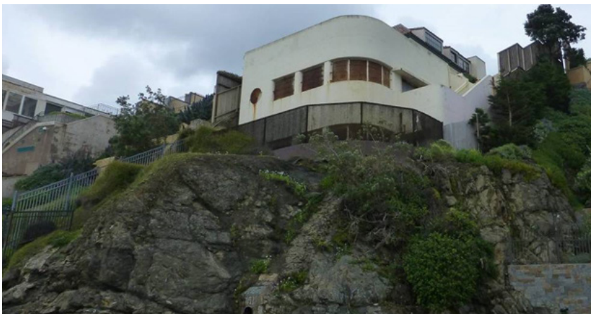
Seacliff 2 Pump Station viewed from the beach.

Our combined sewer system is mostly gravity operated, but in some parts of the City, pump stations are necessary to pump combined wastewater flows to treatment facilities. To convey the flows from the pump stations, force mains are the pressurized pipes that help move flows from the pump station and through the system. Many of our aging pump stations and force mains are being upgraded as part of the Sewer System Improvement Program.