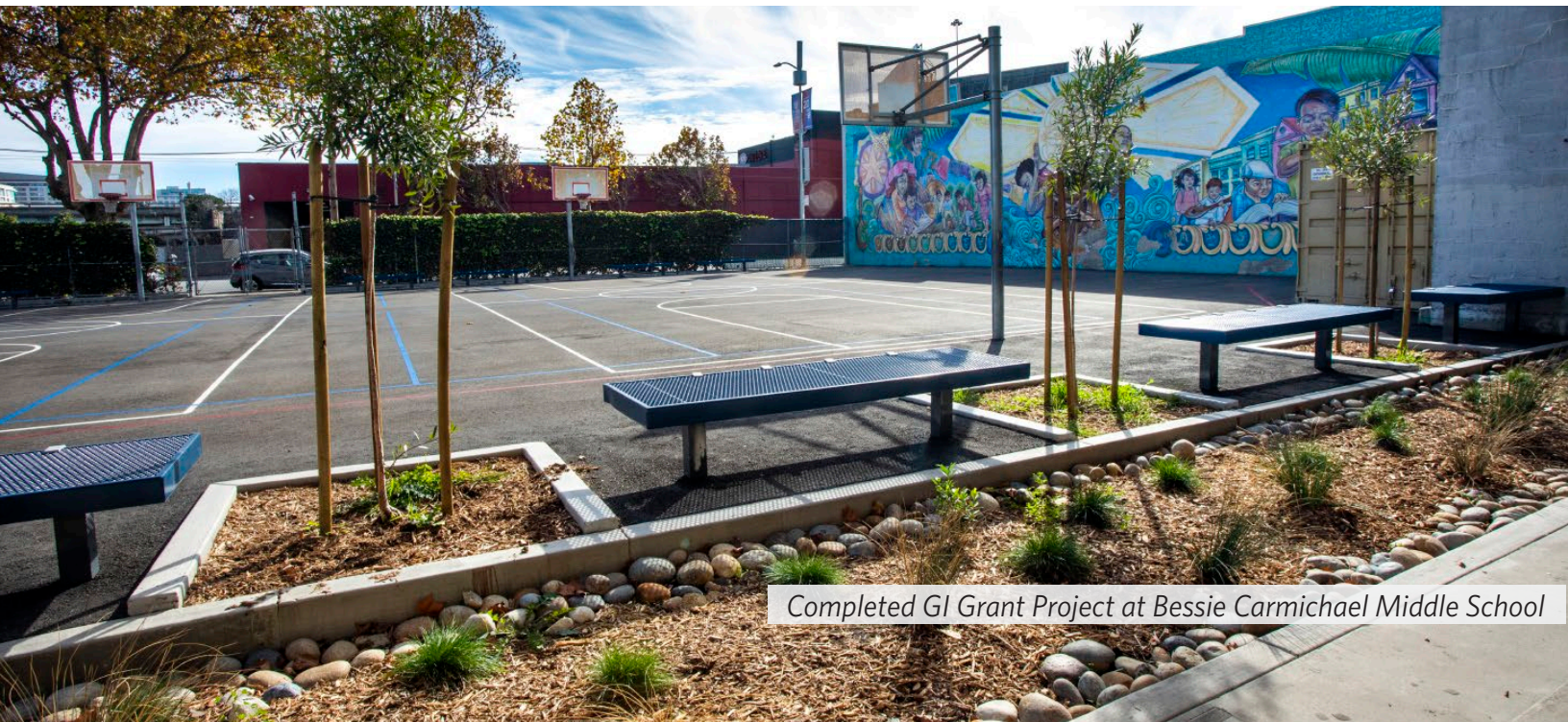
Completed GI Grant Project at Bessie Carmichael Middle School