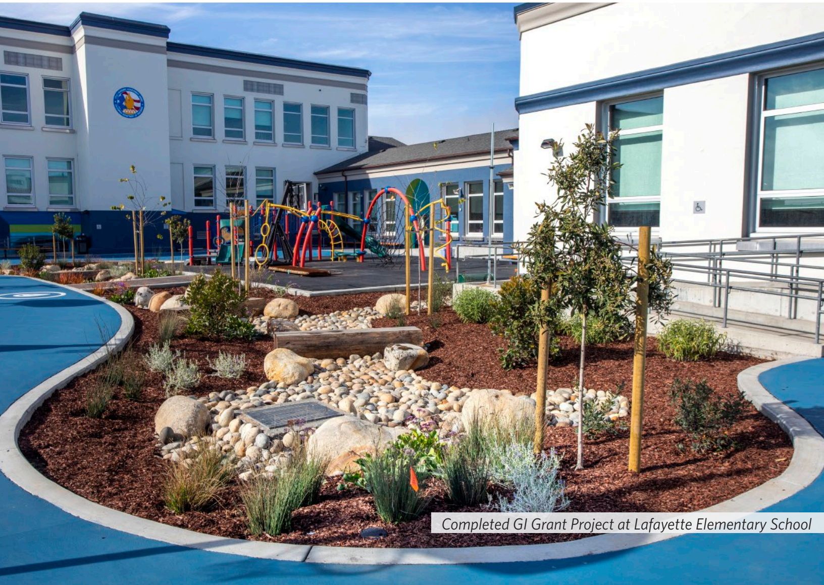
Completed GI Grant Project at Lafayette Elementary School

Please review the Application section of the Grant Program Guidebook and the application checklist on the following page prior to submitting your application.