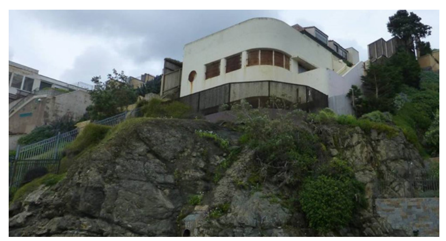
Seacliff 2 Pump Station viewed from the beach.

Our combined sewer system is mostly gravity operated, but in some parts of the City, pump stations are necessary to pump combined wastewater flows to treatment facilities. To convey the flows from the pump stations, force mains are the pressurized pipes that help move flows from the pump station and through the system. Many of our aging pump stations and force mains are being upgraded as part of the Sewer System Improvement Program.